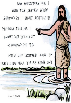
God sent Saint John the Baptist to prepare the people for the coming of Jesus. What did he say when some of the people thought that he might be the saviour? Look in the mirror to find out!

Third Sunday of Advent December 12, 2021