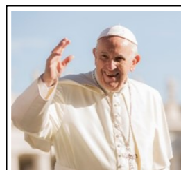
Pope Francis @Pontifex

The life of Jesus and the saints tell us that the seed of peace, in order to grow and bear fruit, must first die. Peace is not achieved by conquering or defeating someone, it is never violent, it is never armed.