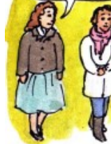
Hi! Are you new here?

Some people have many talents and can do lots of good things. Other people can only do a few things well. But no matter what you can do, God wants you to do your best.