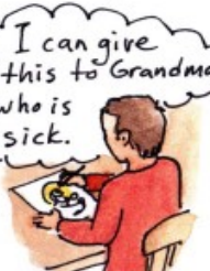
I can give this to Grandma who is sick.

What are some things you're good at? What are some things you are not very good at? Rather than think about the things we can't do, we should be happy to do the things we can, and do them for God! Some people are good at drawing or writing. They can make people happy and teach people about God by drawing pictures or writing stories or letters. Some people are good at talking to people and making friends. They can show God's love and make people happy. Some people have a talent of being patient with others, and show Jesus' love that way. What are your talents? How can you use them to bring people closer to God?