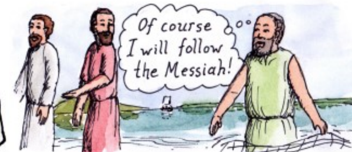
Answer to front page: We have found the Messiah! Answer to Cross-Word: his vocation.

God does not call all of us to very important jobs like the prophet Samuel and Saint Peter. But each of us should follow Jesus and be ready to do His will. If we always try to do what God wants, then we will be ready if He does have a special job for us! How can you do God's will today?